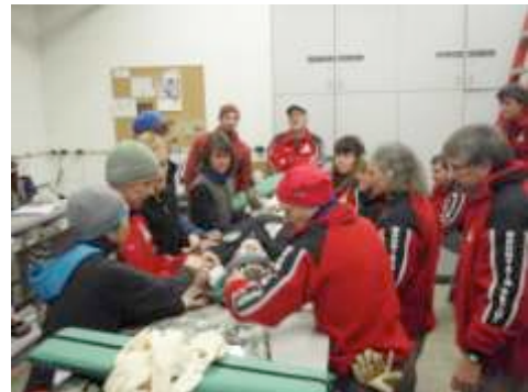
Patient packaging in the Shops.