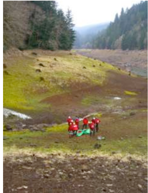
Low angle systems training near Goodman Creek.