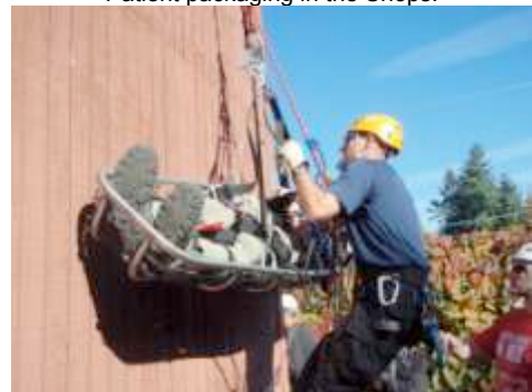
Litter rigging with attendants.