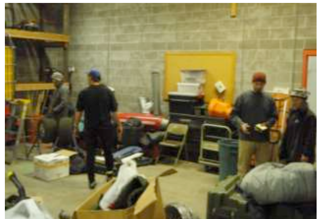
Clean up crew in the equipment bay.