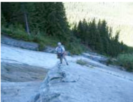
Roddy on the "Sidewalk"

Ex Dome is a 4000' mountain itself and getting to the climb is half the fun. The road leading to the start was overgrown and eventually blocked by the remains of an avalanche that knocked trees across it. The climb starts with a 1500' walk up a 20 degree granite slab to the base. This is affectionately known as the "Sidewalk". It was good to get your friction head on before you get on the rock - but don't slip. You have to do a little N. Cascade bushwhacking around the steep & wet parts of the Sidewalk.